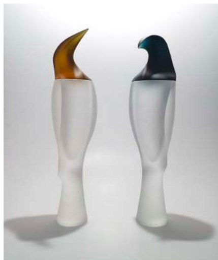
HE MANU KI UTA, KE MANU KI TAI

As the current WCAG/SOTG Board moves into their second year of governance of the Waiheke Community Art Gallery and Sculpture on the Gulf, we would like to acknowledge the continuing effort and dedication that the trustees devote to the Gallery and the three main fundraising events that the board oversees.