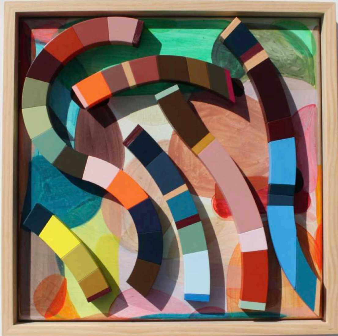
TOY STORY